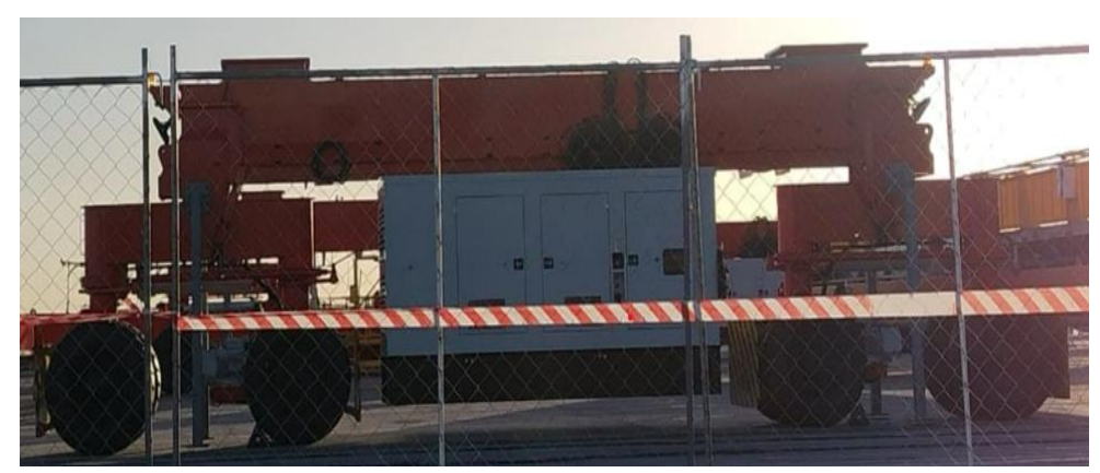
Rubber Tyre Gantries (RTG) assembly in progress