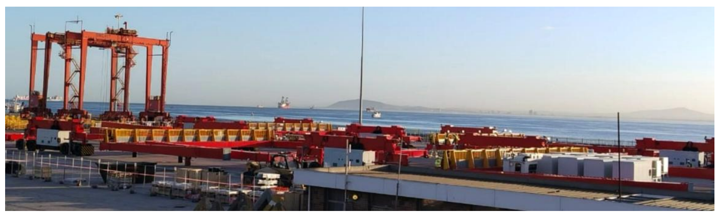
In the foreground, parts of the 9 newly discharged Rubber Tyre Gantries (RTG) at Cape Town Container Terminal (CTCT).